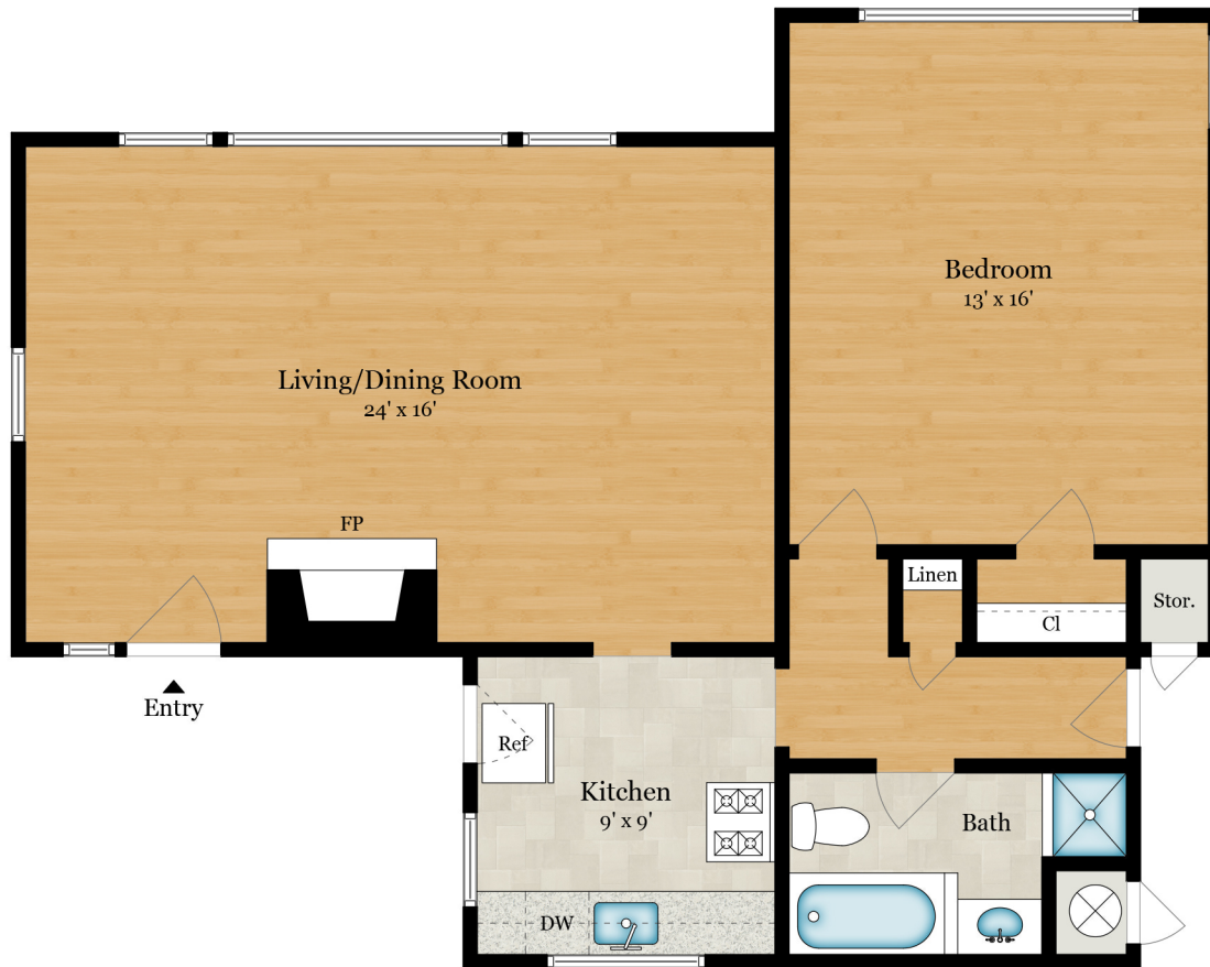
MAIN LEVEL 875 SQ FT